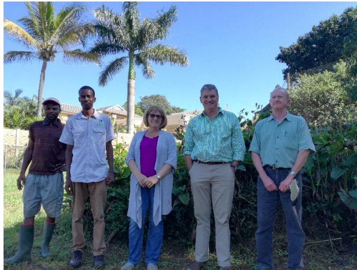
UUST IAP Talk